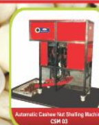
Automatic Cashew Nut Shelling Machine CSM 03