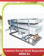
Cashew Kernel Shell Separator CKSS 01