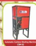
Automatic Cashew Shelling Machine CSM 02