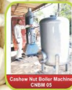
Cashew Nut Boiler Machine CNBM 05