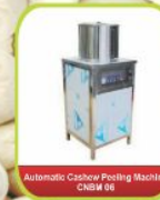
Automatic Cashew Peeling Machine CPM 06