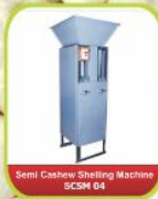
Semi Cashew Shelling Machine SCM 04